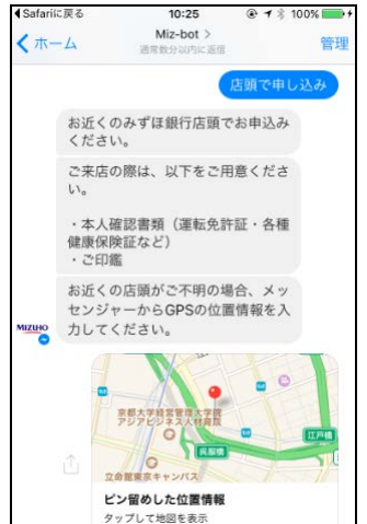
【Photo2】 Amazon Echo/Facebook bot's Trial in WiL